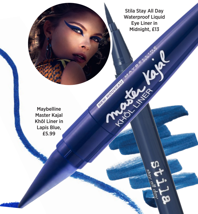
Maybelline Master Kajal Khôl Liner in Lapis Blue, £5.99