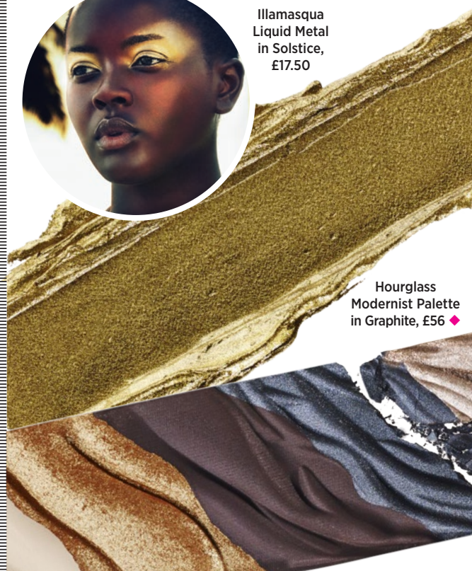
Hourglass Modernist Palette in Graphite, £56