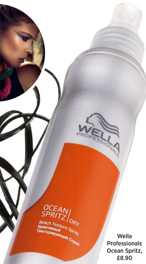
Wella Professionals Ocean Spritz, £8.90