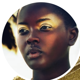
Illamasqua Liquid Metal in Solstice, £17.50